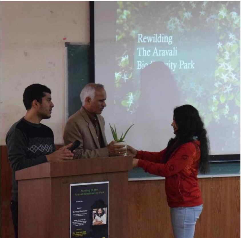
Other Images related to the event